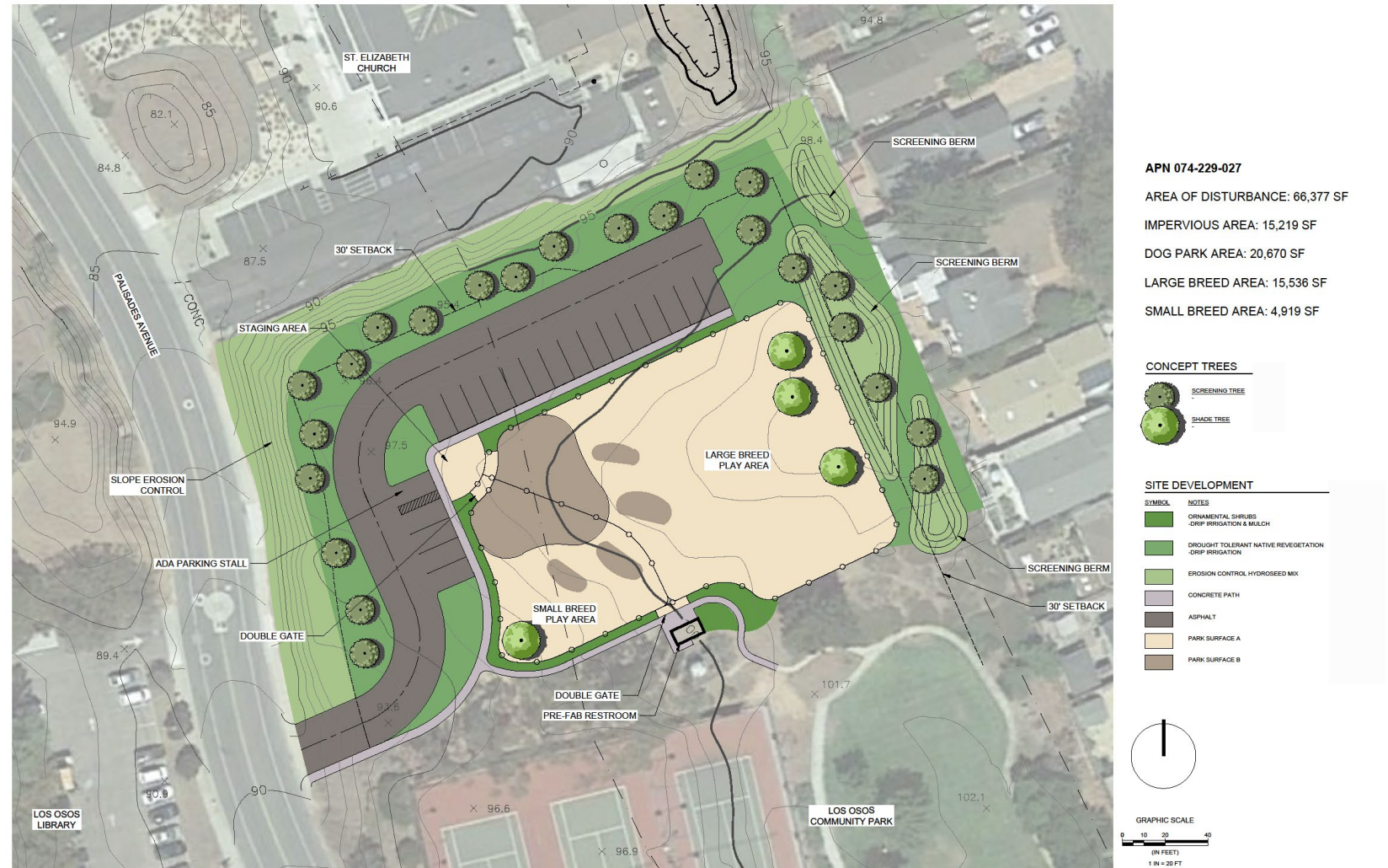
LOS OSOS DOG PARK - CONCEPT PLAN