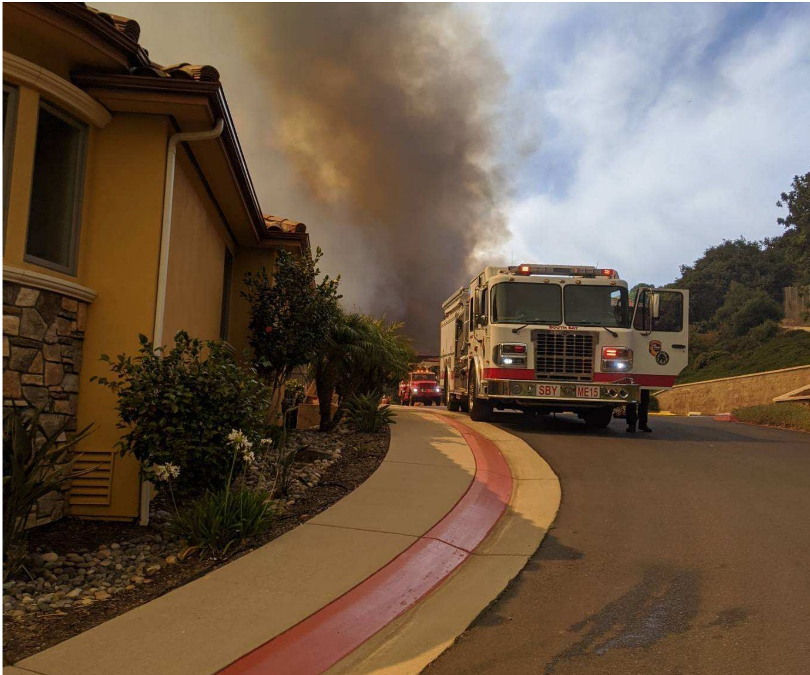
Medic Engine-15 Avila Fire