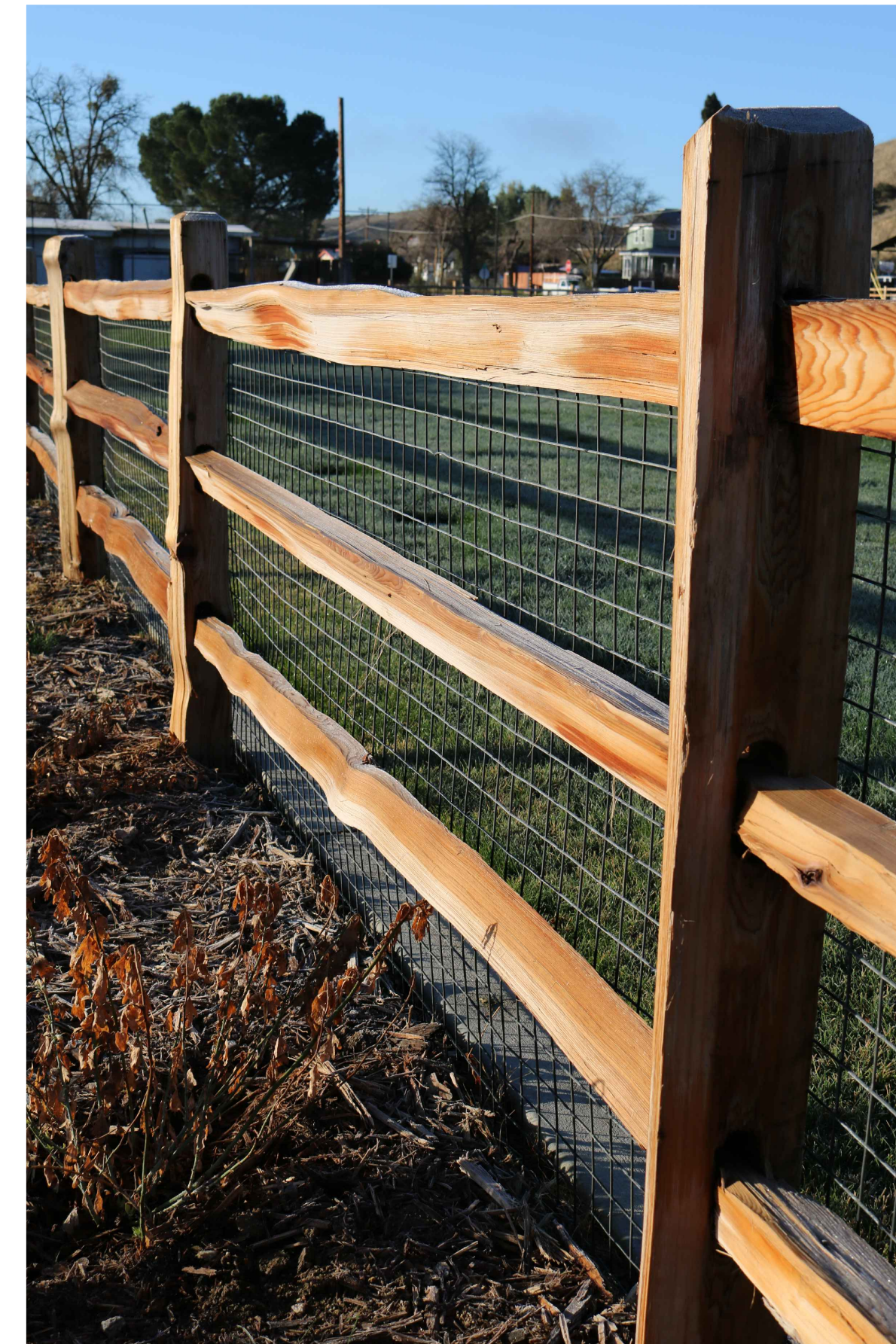
Split Rail Fence - Propose Two Rails & No Wire