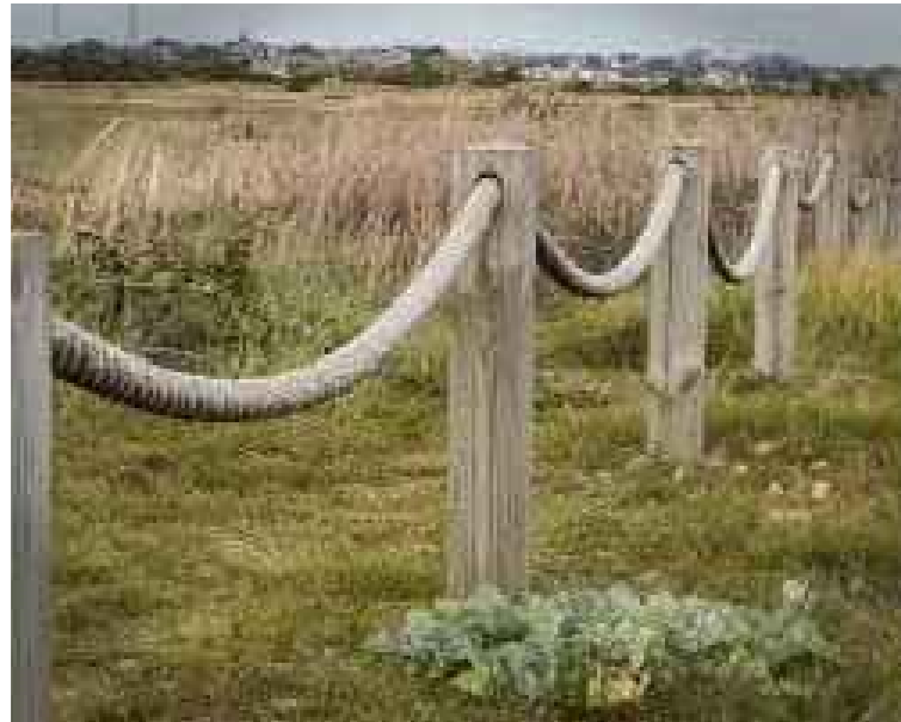
Wood Post and Rope Fence