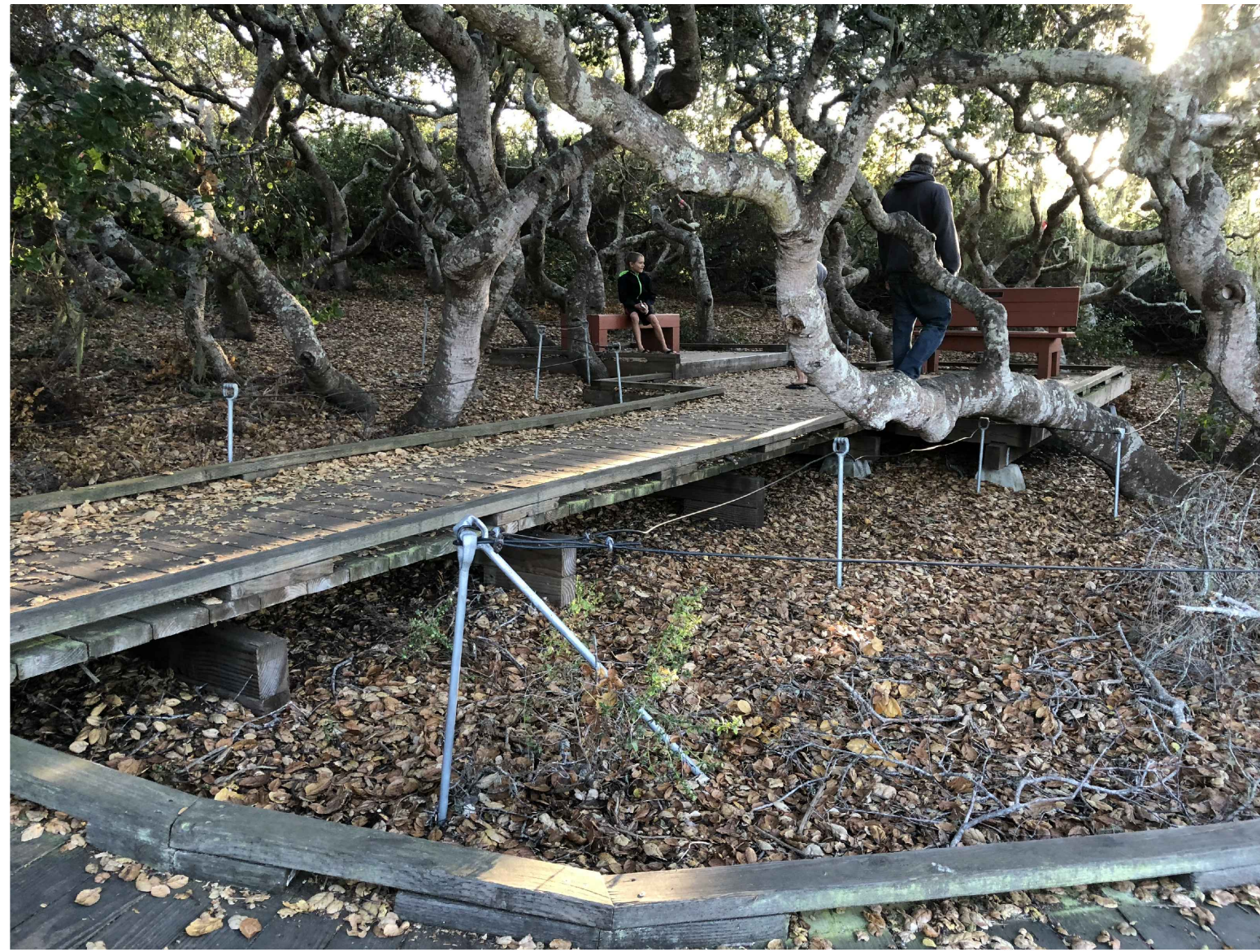
Metal Pole and Wire Fence - Elfin Forest