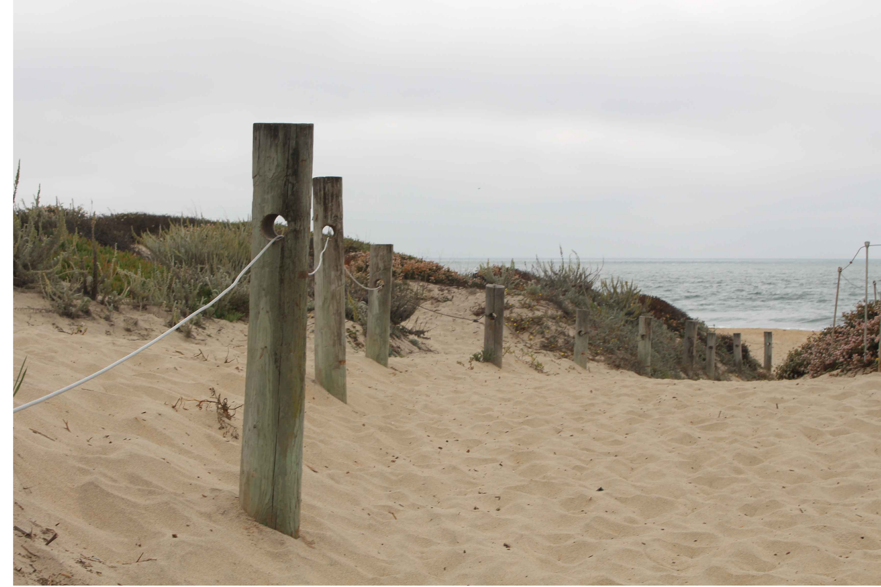
Wood Post and Wire Fence