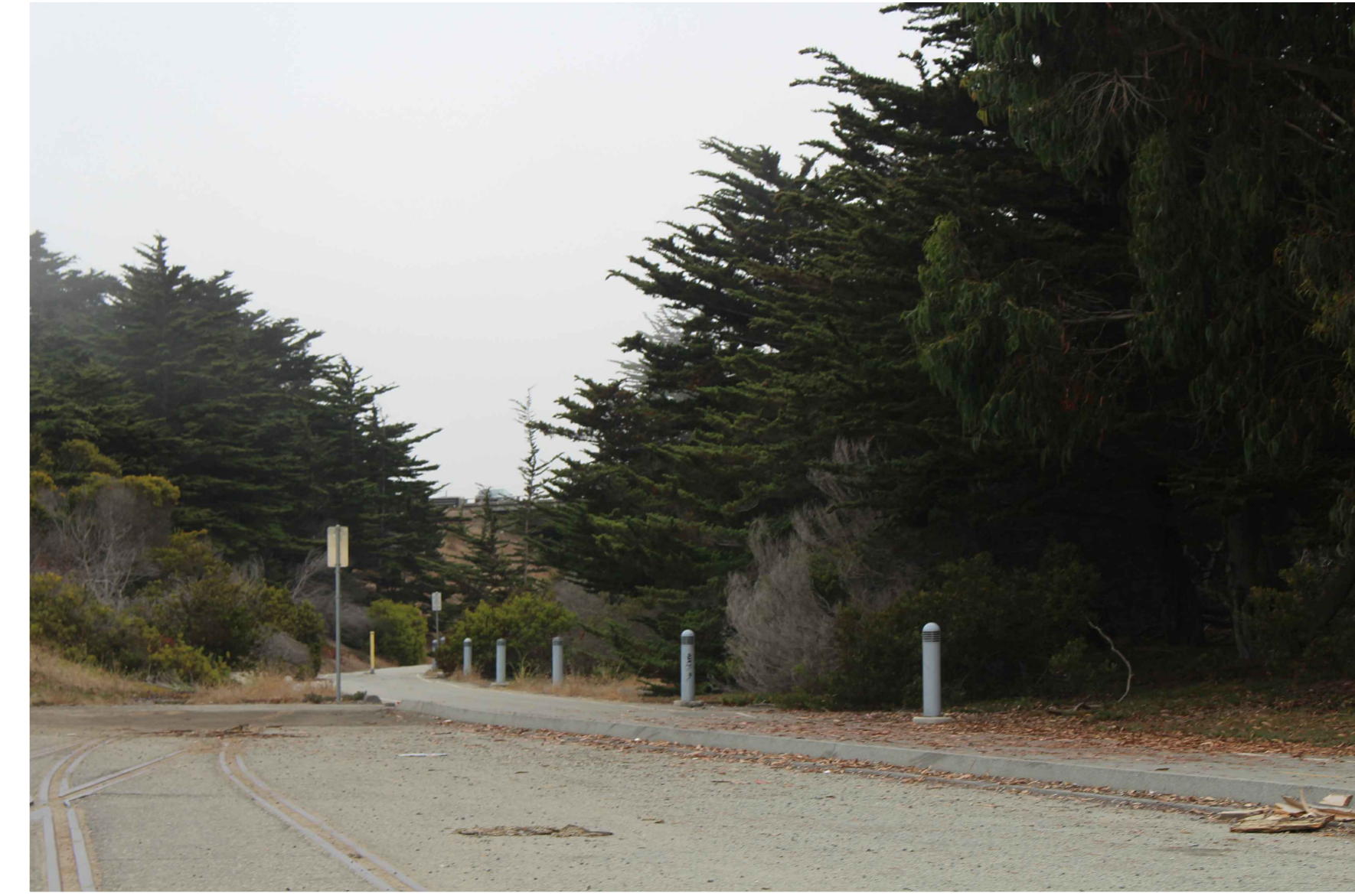
Metal Post - Image for Look of Post Only Fence